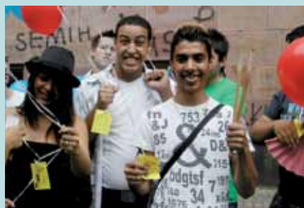
Young leaders at German school

The third example is from an INDIE school in Germany that introduced a project entitled „Schule ohne Rassismus“ (School without racism). The project was the idea of the school council supported by the INDIE group. The majority of the school community had to sign that they supported the idea of a school without racism and agreed that anti-racism should be an on-going theme. The project created a safe learning atmosphere without fear of racism. It showed participation and engagement of learners to be responsible for their environment. The young people's parliament agreed that they will work on this topic on an on-going basis to make the project sustainable.