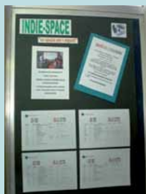
'INDIE space board' in an Italian school

"The student council felt that they were empowered to do something which makes a difference in the every day life of the school" (INDIE co-ordinator, Malta).