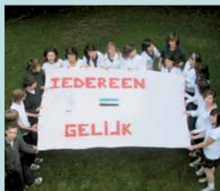
Pupils at an INDIE school in Belgium learning to respect one another

In one Belgian school participating in the project, bullying had been a problem in the past. The 'Het anti-pest project' (anti-bullying project) was targeted at first year students. It aimed to make students aware of the consequences of bullying other students. Pupils were taught to understand that this is unacceptable and to learn to live with each other and race or religion may not be an issue. The project teaches pupils what they should do when they find out someone is bullied and the effects of bullying on other pupils. It teaches them to show respect for each other and to work together in groups.