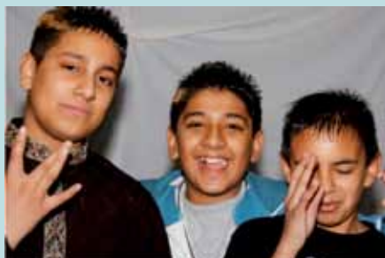
Young leaders, Glasgow

"I suppose to an outsider it would be a hard concept to grasp. The high school rock-band given the same reception as the beep-box and rap, or the Indian traditional dance, or the first year's dance solo. There was a feeling of bonding; the audience is made up of people wanting to support their friends, which creates an atmosphere of love and friendship" (Young leader, Glasgow).