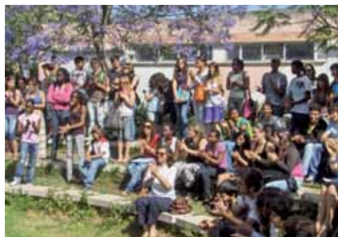
Festa INDIE, secondary school, Portugal